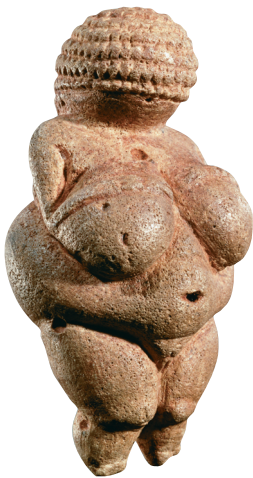
The “Venus of Willendorf.” This tiny ancient figurine is believed to be a fertility symbol.

whose existence has changed little over the millennia. From such sources, historians and anthropologists infer a prehistoric division of labor. By and large, men hunted for game, and women tended to remain close to home. Women nurtured children and gathered edible plants and nuts, crabs, and other marine life that wandered along the shore or swam in shallow waters.