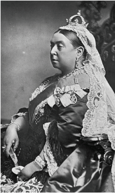
Queen Victoria of England. Sexuality may not have been as repressed as advertised during the reign of Queen Victoria.

nature as eating or drinking. Calvin rejected the Roman church's position that sex in marriage was permissible only for procreation. He believed that sexual expression in marriage also strengthened the marriage bond and helped relieve the stresses of everyday life.