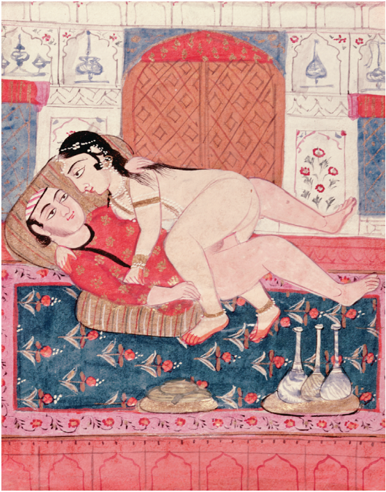
An Illustration from the Kama Sutra . The Kama Sutra , an Indian sex manual believed to have been written sometime between the third and fifth centuries CE, contained graphic illustrations of sexual techniques and practices.