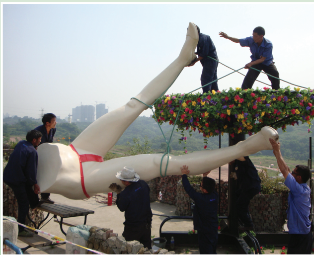
Love Land. Workers pull down the bottom half of a giant female mannequin that would have towered over the entrance to the sex theme park.